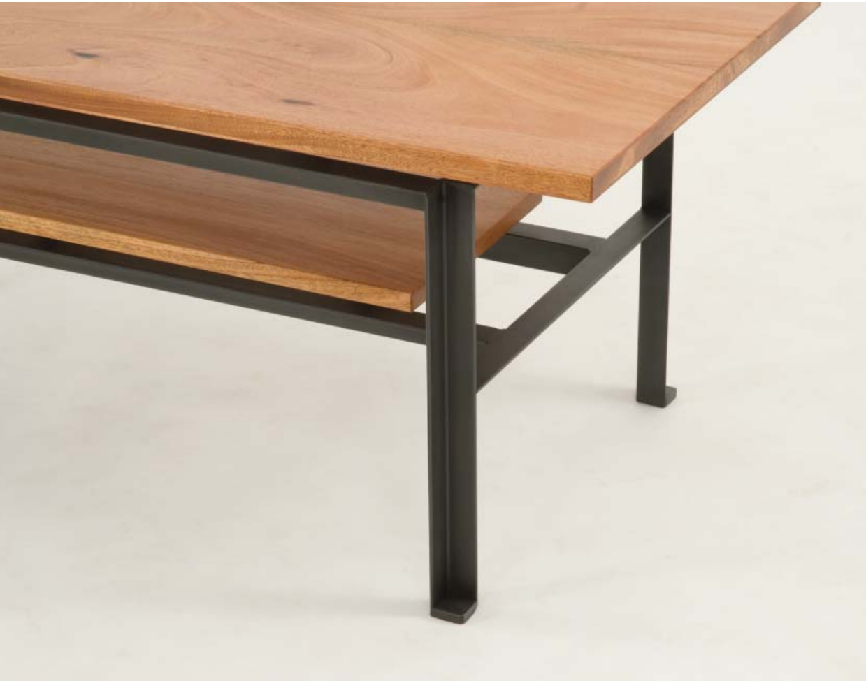
Butterfly Table | Winter 2009 | Vanags | Mauldin | UW Furniture Studio